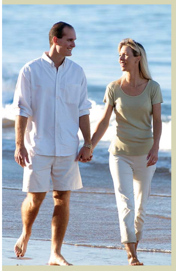
Your life can unravel quickly with a serious illness – let AssurityBalance Critical Illness Insurance help provide the financial strength you'll need to recover.