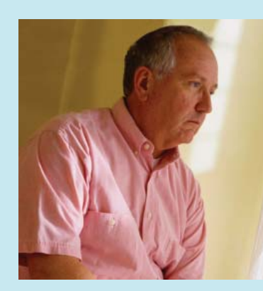
Pat. 56 Omaha, Neb.

Policy Form Nos. CI-005 or I H0810 and CI-007 or I H0820. Product availability, features and rates may vary by state.